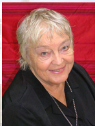
Erin Pizzey, Shelter Move- ment Founder

Featuring Presenters From National Family Violence Legislative Resource Center www.nfvllrc.org